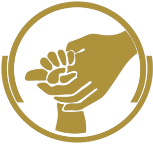
Asian Mission Outreach Foundation